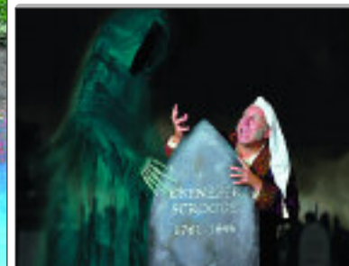
Tony Panighetti as Scrooge

Cabrillo Stage Production with new cast runs December 17 through 30 at the Cabrillo Crocker Theater